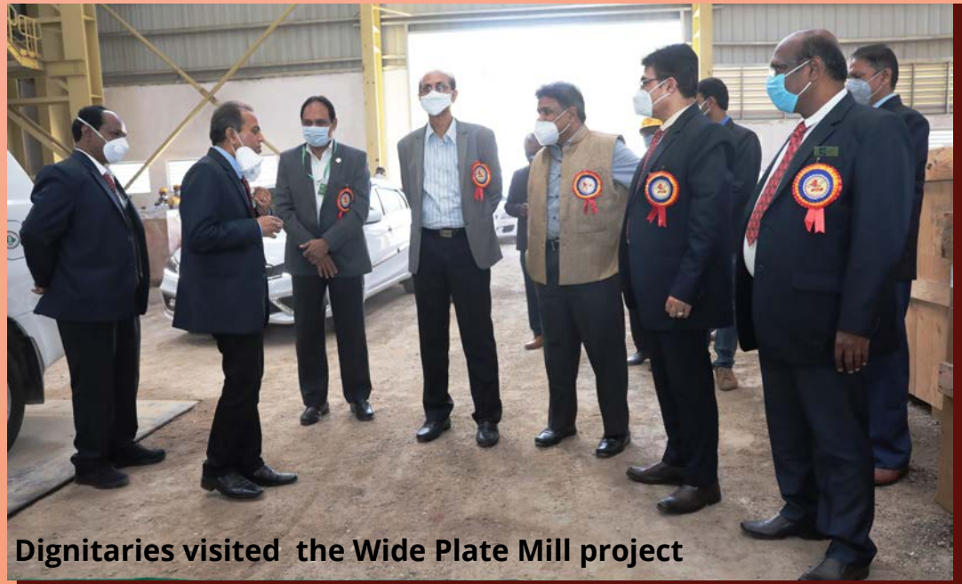
Dignitaries visited the Wide Plate Mill project

The second session was dedicated to a cultural program organized and performed by the employees and their family members on the occasion of the 47th MIDHANI formation day.